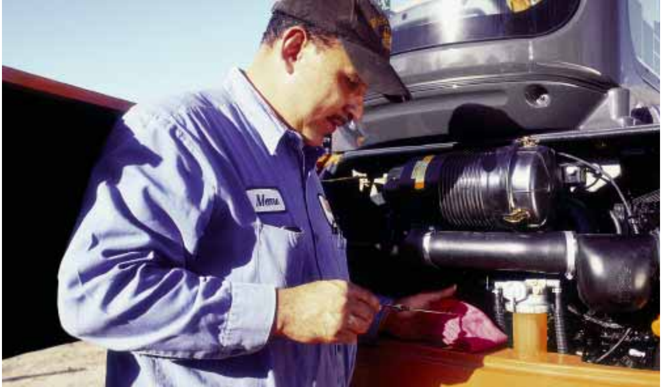
Ground-level fluid checks make daily maintenance quick and easy.