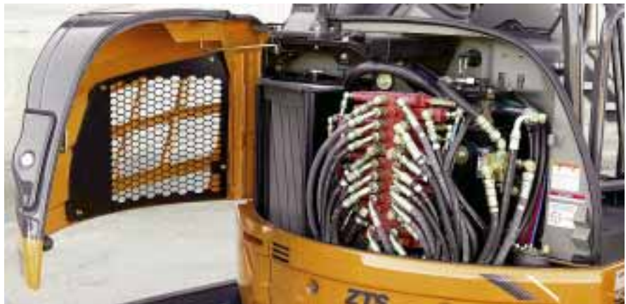
A one-piece, swing-out side access panel gives access to cooling components, valves and the operator control pattern change valve.