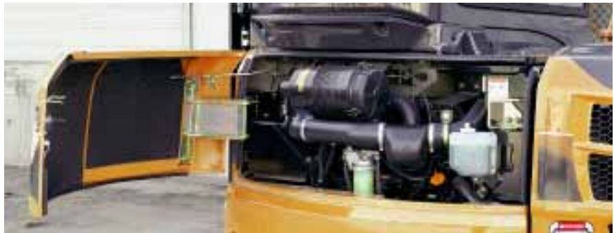
The engine access door allows easy access to the air filter, oil level check and fill, coolant overflow and the fuel filter.

Heavy-duty travel motors provide excellent speed and traction. These are efficient, two-speed axial-piston motors with planetary gear reduction. Heavy plate guards prevent damage to the hydraulic piping and components — added assurance that Case CX Series compact excavators are built for dependable performance.